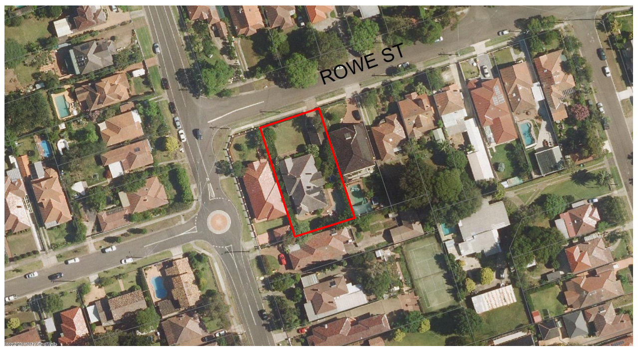
Figure 3: Aerial Photograph of the site

The subject site which is approximately 1125m<sup>2</sup> contains an intact Federation style dwelling and associated gardens as shown in Figures 3 and 4.