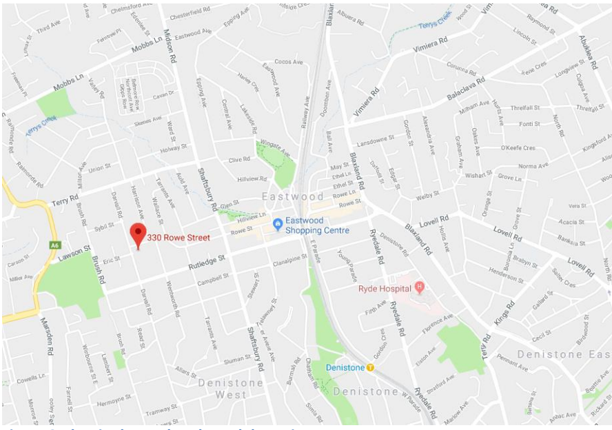
Figure 2: the site located at the red drop pin

A site location plan is shown at Figure 2 and an aerial photo of the site is shown at Figure 3