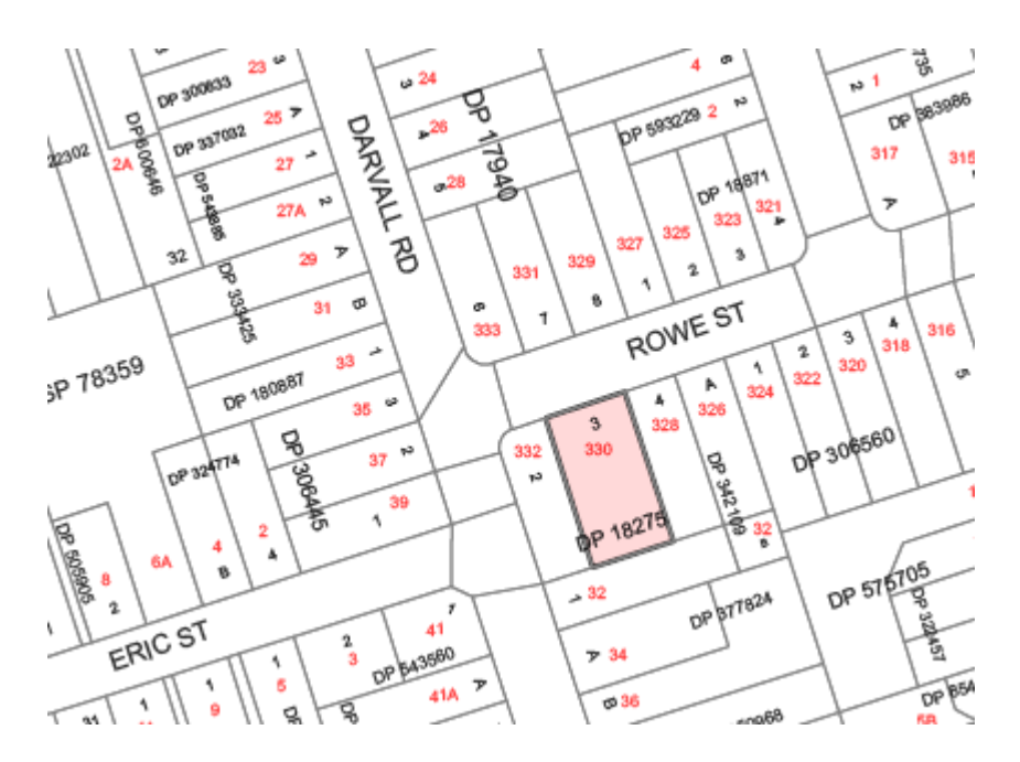
Figure 1: Subject site, 330 Rowe St Eastwood

This planning proposal applies to the land known as: 330 Rowe Street, Eastwood (Lot 3 DP 18275) identified on the map titled Draft Site Identification Map shown in Figure 1 (Refer also to Attachment 1)