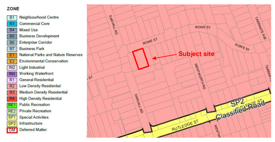
Figure 6: Current Site Zoning (Land Zoning Map – Sheet LZN_002 of the RLEP2014)

Bed and breakfast accommodation; Boarding houses; Business identification signs; Child care centres; Community facilities; Dual occupancies (attached); Dwelling houses; Environmental protection works; Group homes; Health consulting rooms; Home-based child care; Home businesses; Home industries; Hospitals; Multi dwelling housing; Places of public worship; Recreation areas; Residential care facilities; Respite day care centres; Roads; Secondary dwellings.