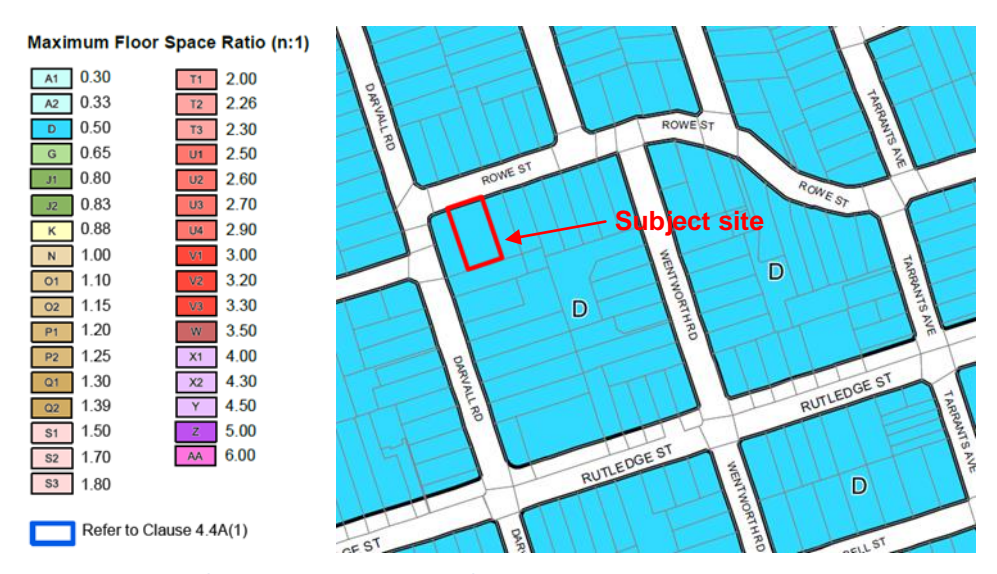
Figure 8: Current Floor Space Ratio as per Ryde LEP 2014

The maximum floor space ratio relating to the site is 0.50:1 as per Ryde LEP 2014 Floor Space Ratio Map. (See Figure 8 below)