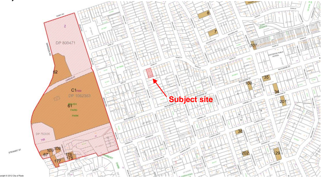
Figure 5: Heritage Items in the properties vicinity

Locations of local heritage items in the vicinity of the site are shown in Figure 5. The subject site is shown red hatched