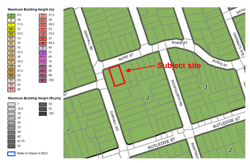
Figure 7: Current Height of Buildings (Height of Buildings Map - Sheet HOB_002 of the RLEP2014)

The maximum building height relating to the site, is 9.5m as per Ryde LEP 2014 Height of Buildings Map. (see Figure 7 below)